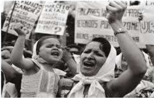
La marcha de las Madres de Plaza de Mayo contra la dictadura cívico-militar en Argentina (1976-1983) marcó un hito a nivel internacional en la defensa de los derechos humanos y la resistencia frente a la injusticia.