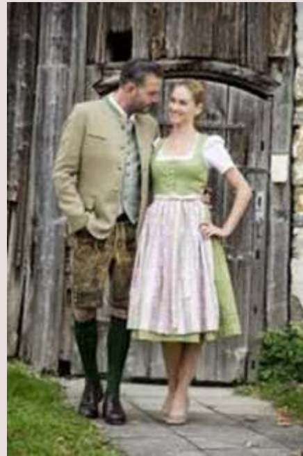
THE NEW GENERATION