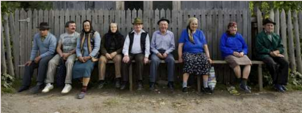
THE OLDER GENERATION